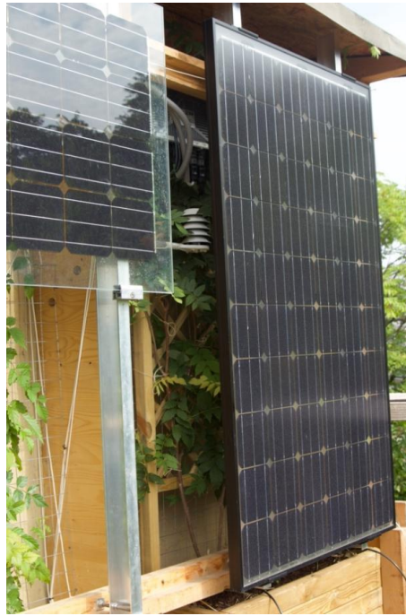
Figure 2. Test area mounted on the Eco-Testing- Station (“Öko-Prüfstand”) – Test Area of the Research Center of the Building Physics and Sound Protection.

Figure 2 shows the test area used in [10,11], which has been operable since July 2015 and was a part of a long-term project.